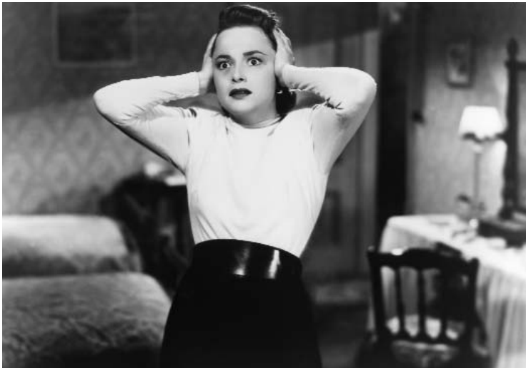
Olivia de Havilland in “The Dark Mirror” (Robert Siodmak, 1946).

The National Society of Film Critics, meeting in New York in January to announce awards for the finest film achievements of the year, issued a special citation “to the UCLA Film and Television Archive for its long-lived and heroic work in film preservation, restoration and resurrection, including its recent rehabilitation of rehearsal and test footage from Charles Laughton’s ‘The Night of the Hunter.’”