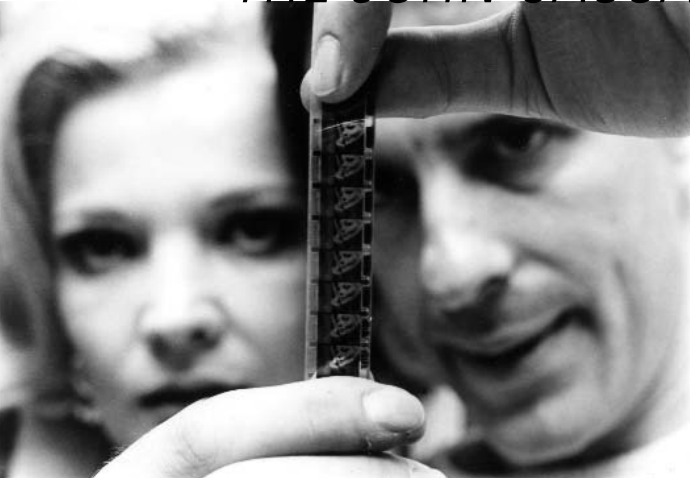
Gena Rowlands and John Cassavetes.

"I am more interested in the people who work with me than in the film itself, or in cinema." So said John Cassavetes, who typified the independent filmmaker's particular fascination with improvisational "truth" in the performances of his actors.