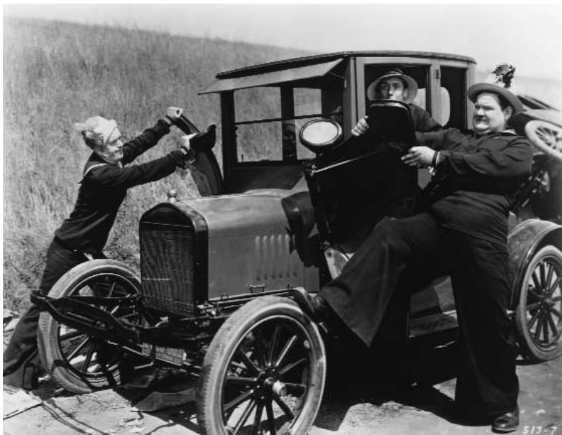
Laurel and Hardy in "Two Tars" (James Parrott, 1928).

The Archive has received a grant of $10,000 from the Academy Foundation for the Moving Image Archive Studies internship program. A key goal of the MIAS program is to link theory with practice. Internships are essential for building bridges between the academic and professional worlds; and internships in the Los Angeles area in collaboration with other archives, libraries, museums, studios and laboratories form a vital part of the curriculum.